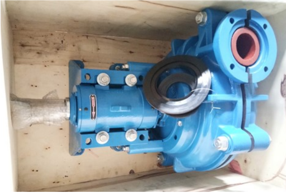
Performance Curve with Standard Impeller, Metal 5-Vane E4147A05: